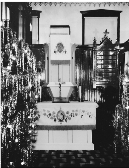
interior shot of St. Paul's Lutheran Church, early 20th century