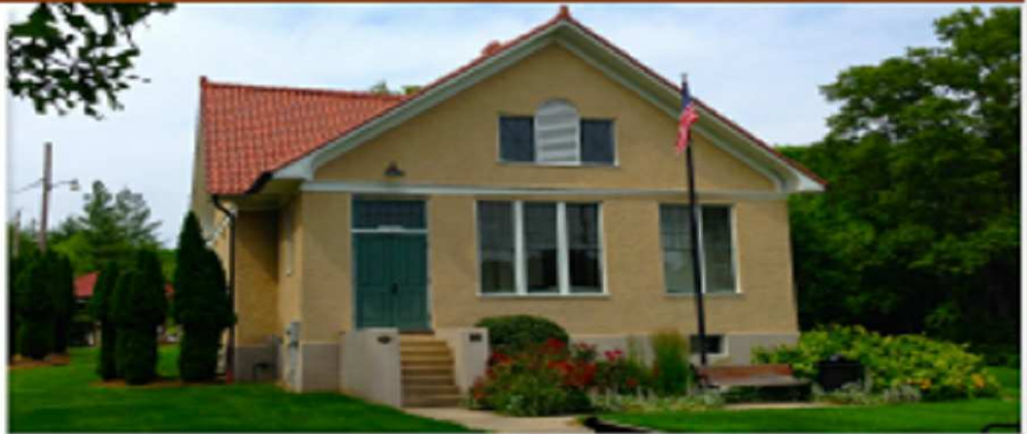
Old Pond School (1914-1951), located at 17123 Manchester Road Listed on the National Register of Historic Places in 2012